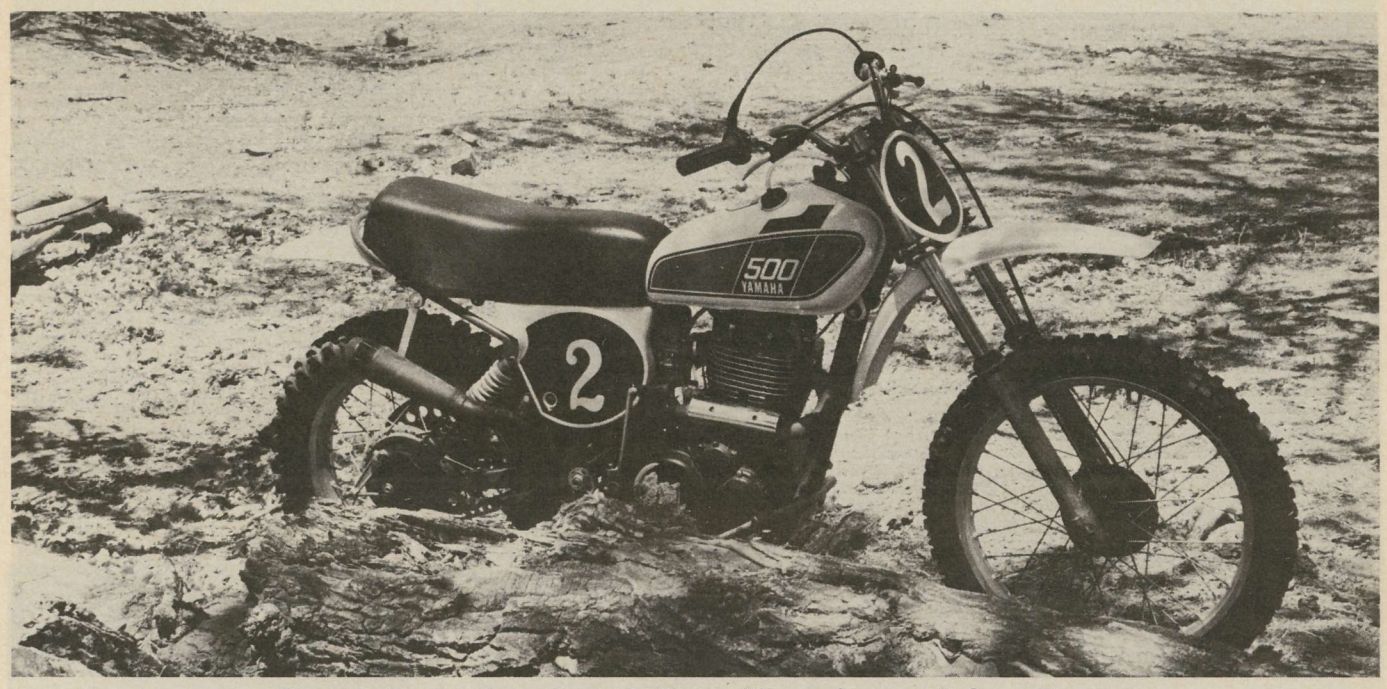
The completed package doesn't look that different from stock. Super-Trapp silencer reaches a fine compromise between power and quiet.